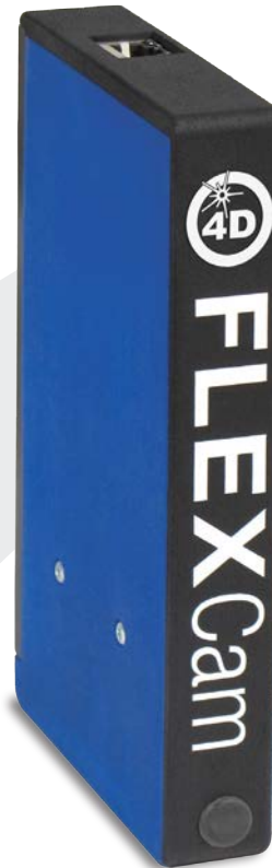
FlexCam Roughness and Defect Metrology Module

Each module processes all data on-board, calculating and reporting statistics in real-time , for incredible processing speed. In production mode, simple controls and pass/fail criteria make it easy to monitor the process. In engineering mode, 2D analyses, statistics and visualization tools help you to quickly dial in process parameters and examine individual defects with high fidelity.